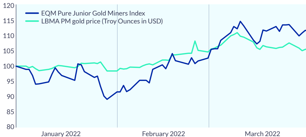
Indexed Price Levels

Data is rebased to 100. Past performance is no guarantee of future results.